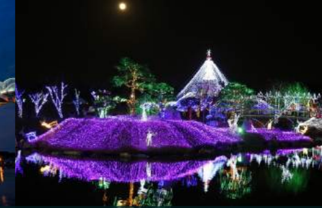
TAEAN NIGHT LIGHT FESTIVAL

INCHEON > TRANSFER TO TAEAN > BAEKSAJANG PORT+CULINARY STREET > DAEHARANG KKOTGAERANG BRIDGE > TAEAN NIGHT LIGHT FESTIVAL