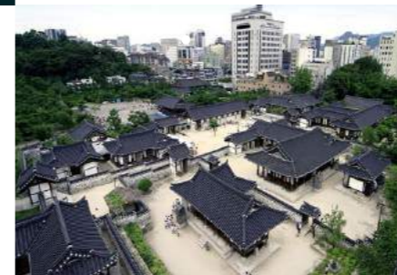
NAMSANGOL HANOK VILLAGE