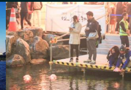
TIME SLIP MARKET