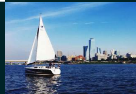
HAN RIVER YACHT EXPERIENCE