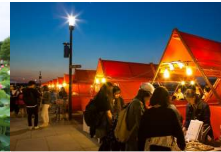
ROMANTIC MOONLIGHT MARKET