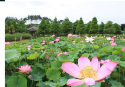
TAEAN LOTUS FLOWER FESTIVAL