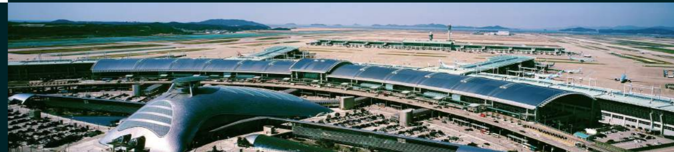
INCHEON INT'L AIRPORT

SEOUL > CHUNGHA GROCERY SHOP > TRANSFER TO INCHEON INT'L AIRPORT