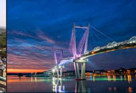
DAEHARANG KKOTGAERANG BRIDGE